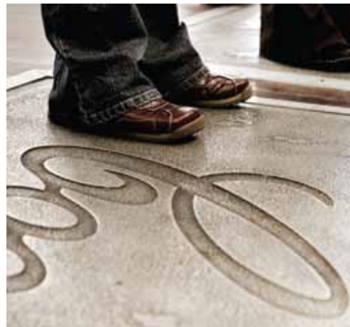
All Bar Nun, Canberra