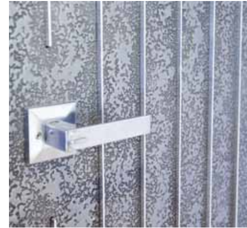
PBS Building Services, Canberra