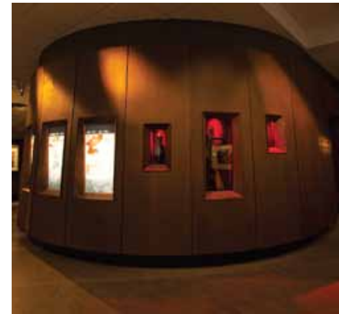
Australian War Memorial, Canberra

lustre fx extends the creative boundaries of architects and designers by producing enticing surfaces beyond imagination