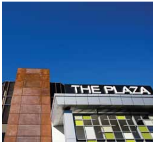
The Plaza, Palmerston North, New Zealand