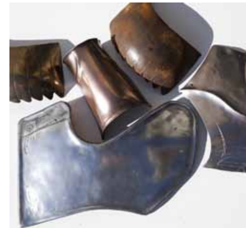
Lord of the Rings (armor), Weta Workshop NZ