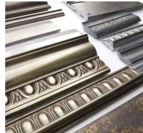
Custom moldings, cornis & architrave range

Visit our showroom or go online for a full range of products and finishes