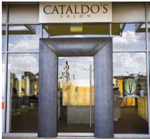
Cataldo's Salon, Sky Plaza, Canberra