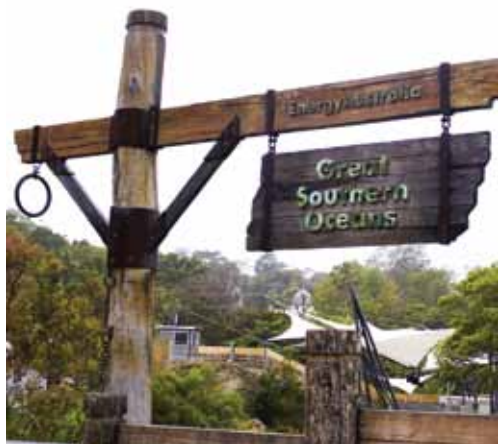
Taronga Zoo, Sydney