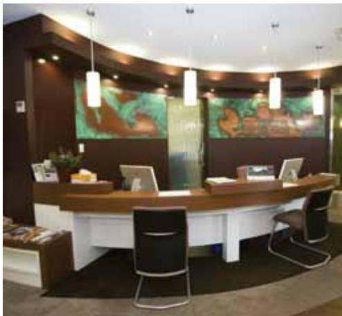
Preventive Dental Care, Canberra