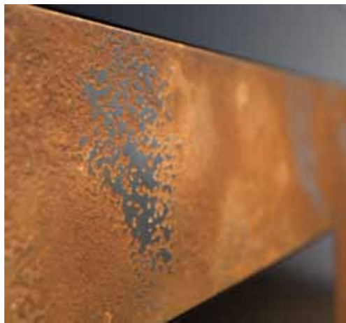
Detail - Iron Heavy Rust Patina