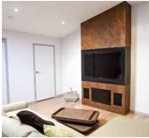
Custom entertainment unit & coffee table