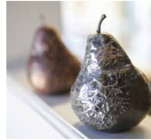
Decorative ornaments and art objects