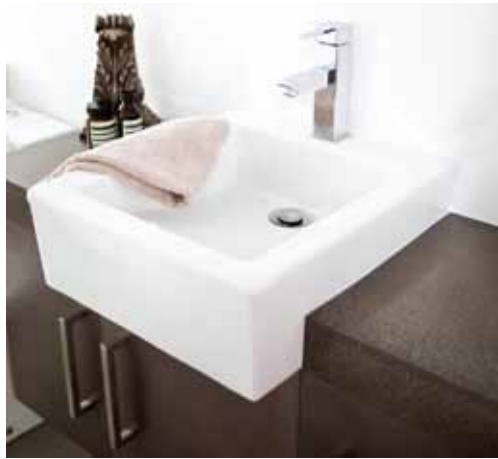
Vanity unit and top