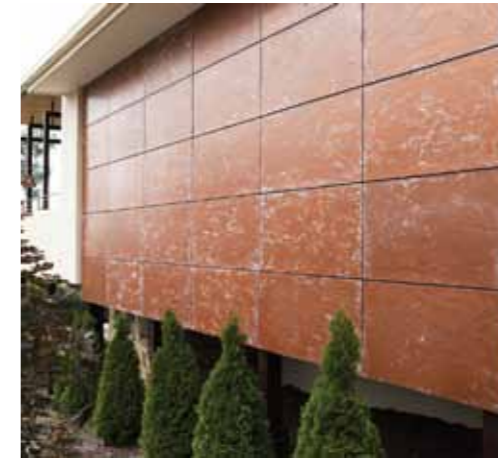
Exterior Copper wall cladding system