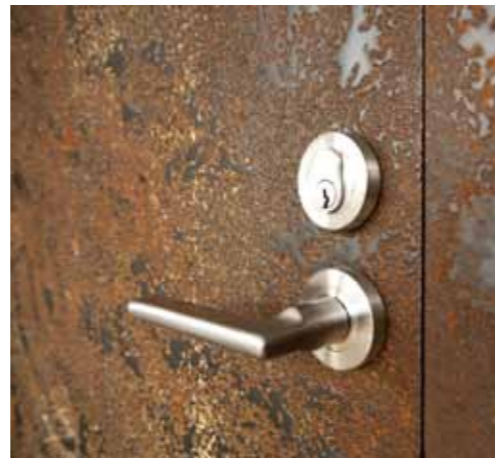
Detail - Iron Heavy Random Rust

be the envy of your street... make a statement with a customised feature, like your front door or house numbers in your choice of metal coating