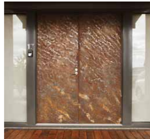
Double front entry doors