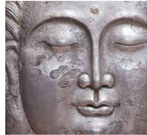
Garden art and sculpture