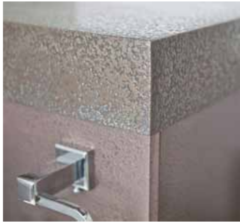
Custom two tone - Bronze / Copper Medium